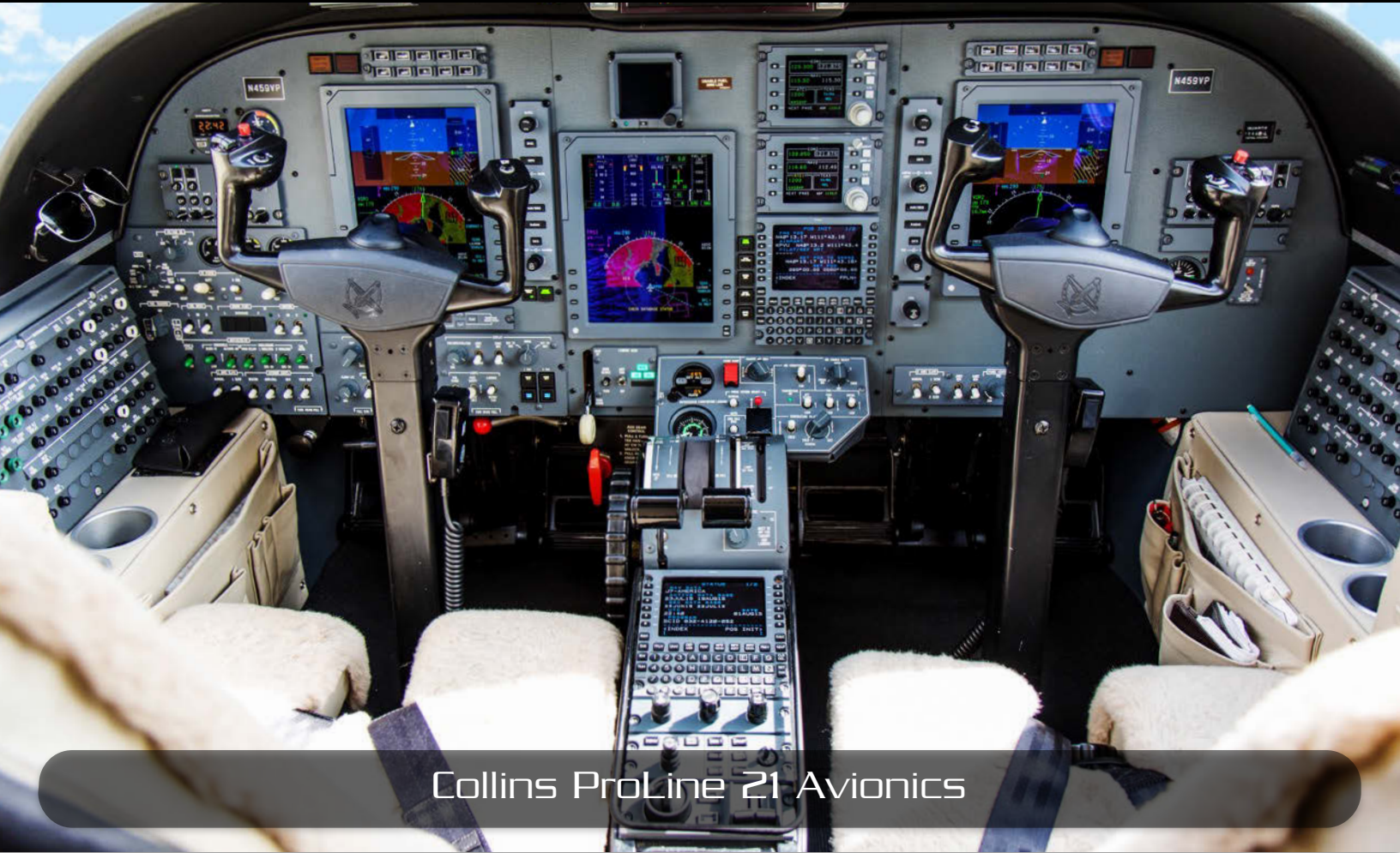
Collins ProLine 21 Avionics